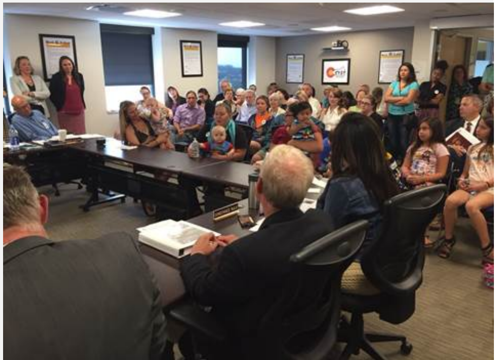
On July 6, dozens of parents who use the Colorado Works program testified in front of Colorado's Human Services Board to support a proposal to raise basic cash assistance for the first time in 10 years. Approved by a 6-2 vote, CCLP and its advocacy partners worked diligently to make the proposal a success.

CCI and county government representatives agreed that an